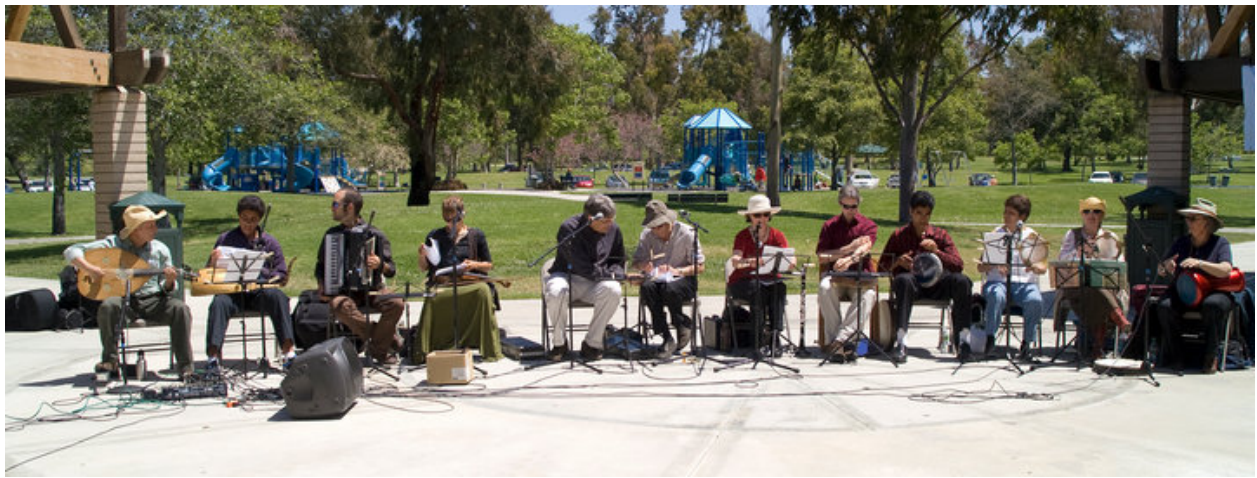
The UCSB Middle East Ensemble at the Sham-El-Nessim picnic-- Please go to the E.A.O. FACEBOOK for more photographs of the event