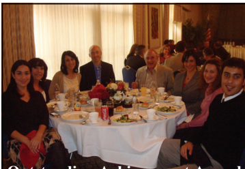
Outstanding Achievement Award

Please feel free to forward this email to all your friends. Send us their emails, so we can add them to our list. To unsubscribe, just click here "remove"